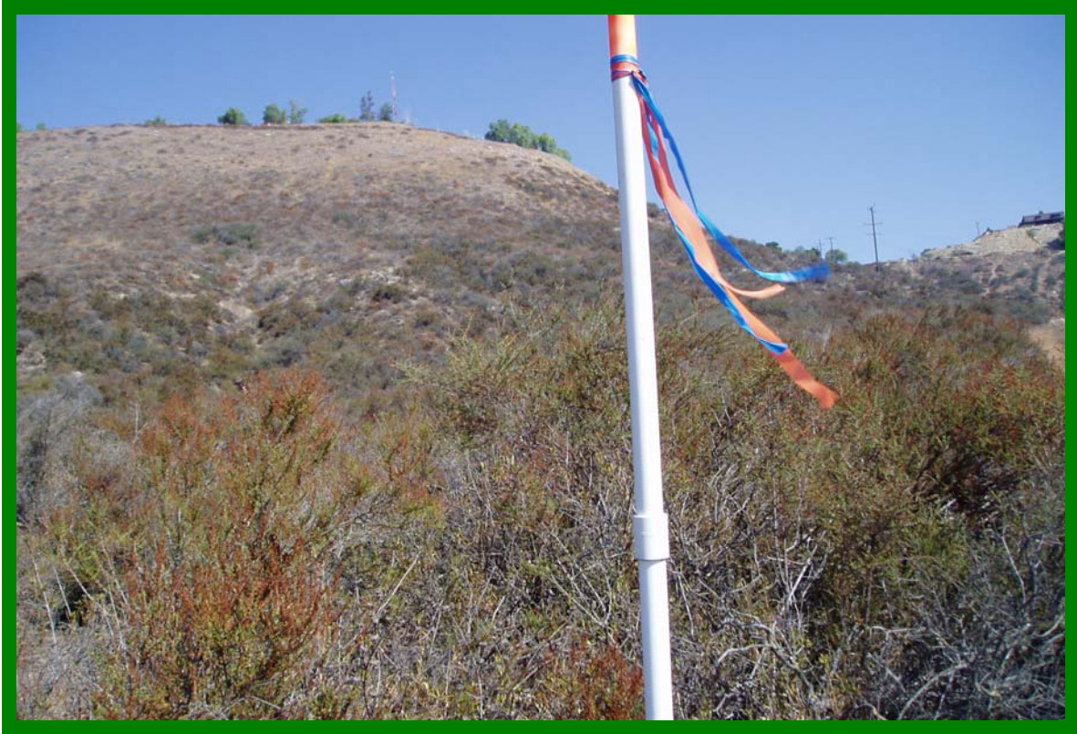
Southeast corner looking towards the northwest corner.