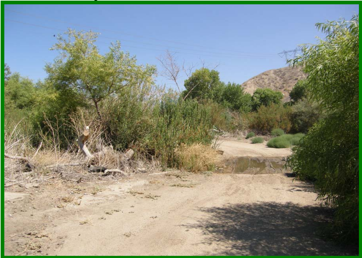
Wet area near middle of property.