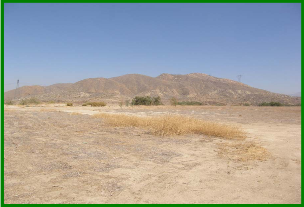
From entrance looking northeast.