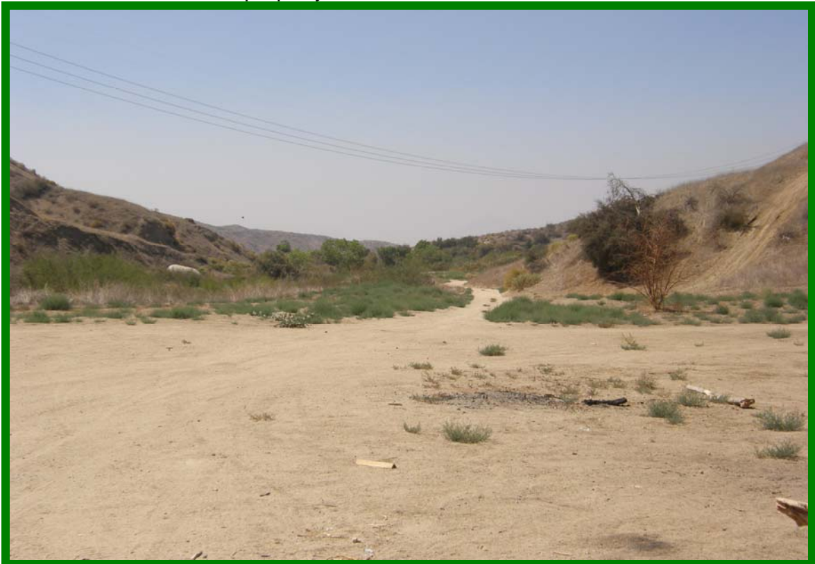
End of road looking south.