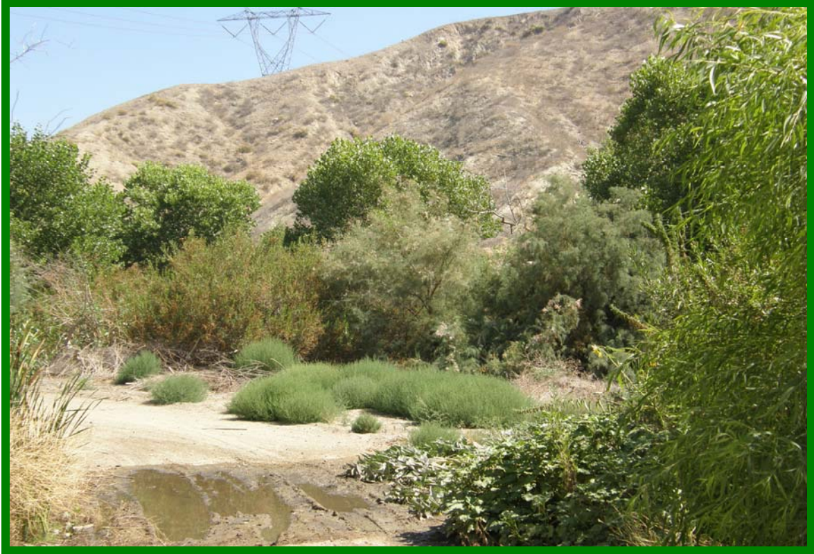
Wet area near middle of property.