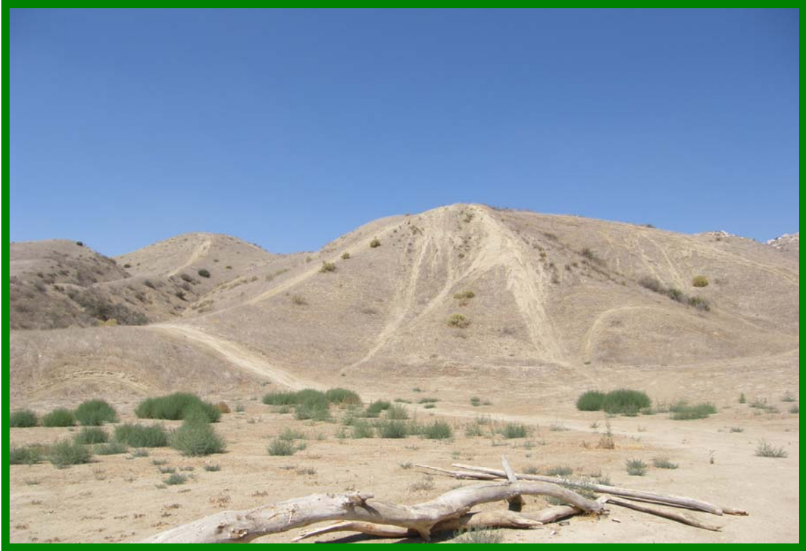
End of road looking northwest.