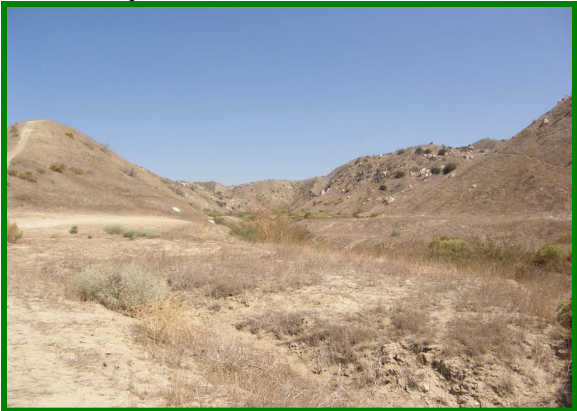
Drainage area through property.