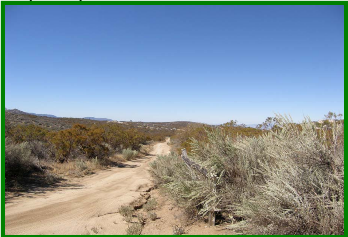
Looking west along Becker Road.