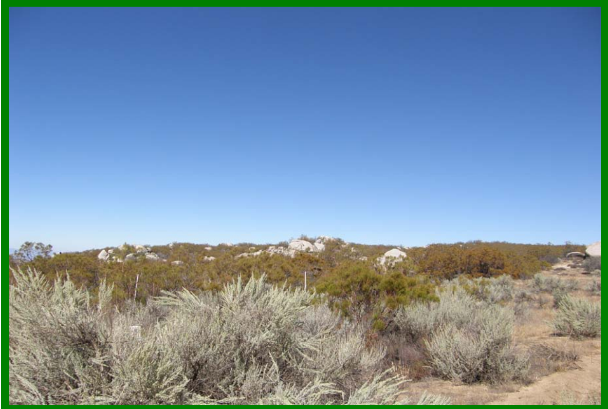
Parcel P looking northwest.