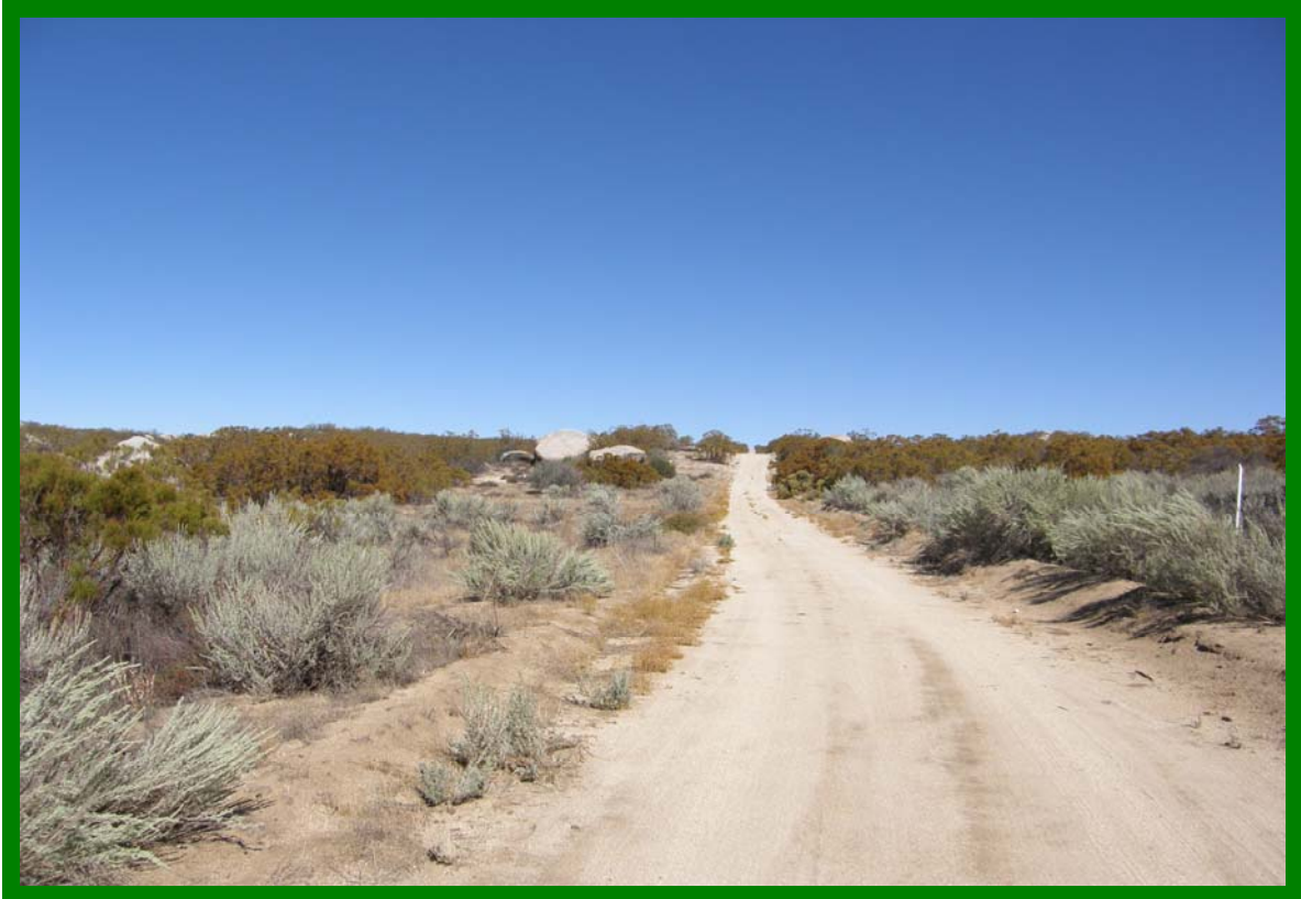
Looking north along Lundahl Lane.