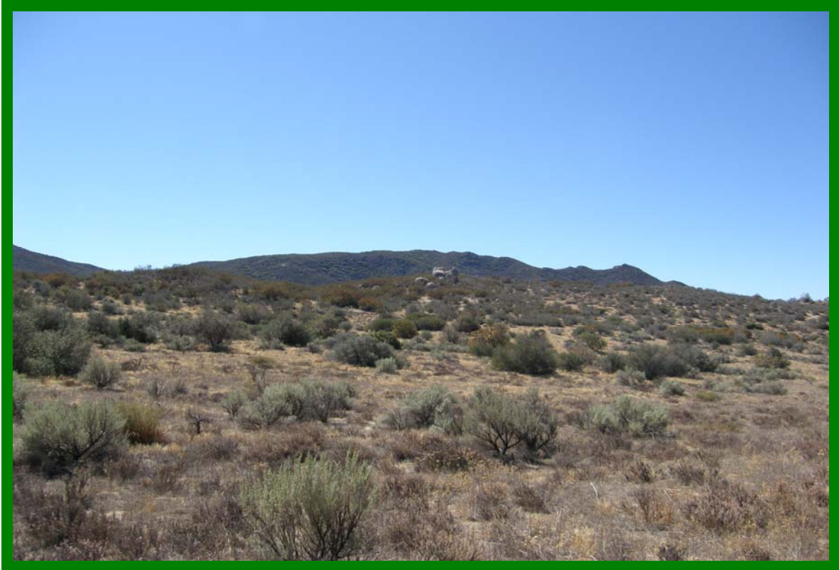
Parcel N looking south.