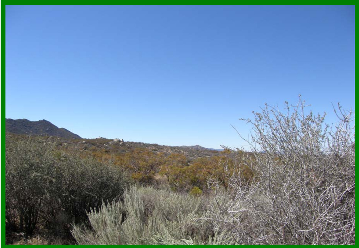
Parcel P looking southwest into Santos property.