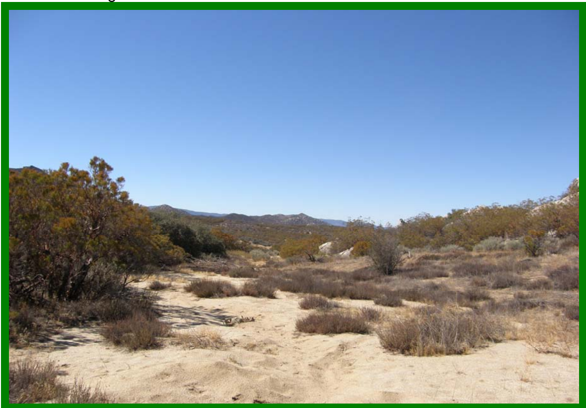
Parcel O looking south down wash.